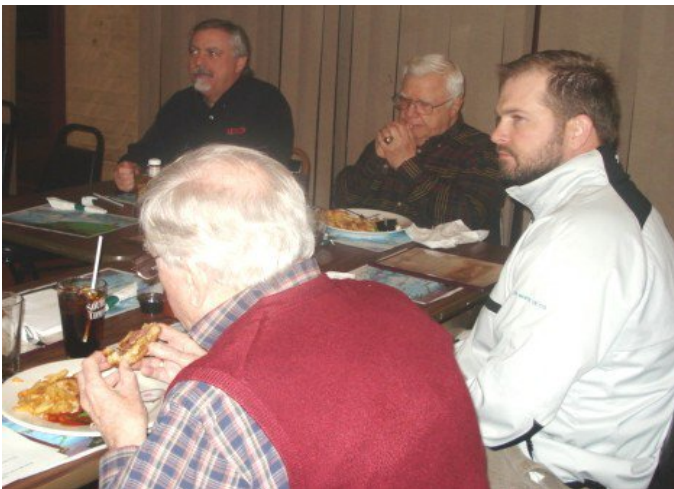
Four of the 14 members and friends come out to hear a great speaker.