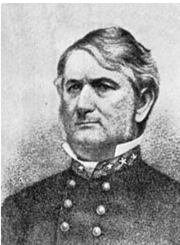
Lt. Gen. Leonidas Polk

The Constitution of the Confederate States of America specifically invoked “Almighty God”, unlike the U.S Constitution, and the Confederate Constitution prohibited the foreign slave trade.