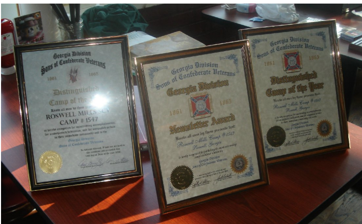
Certificates award Roswell Mills Camp at Division Reunion...Distinguish Camp of the Year and Outstanding Newsletter Award.