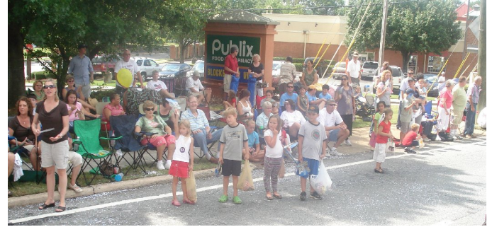
Spectators at the Old Soldiers Day Parade