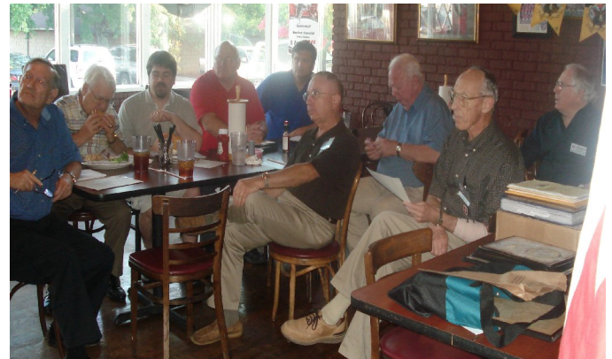
Members enjoying Show and Tell at July Meeting