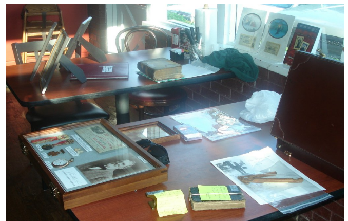
A few articles brought by Compatriots.